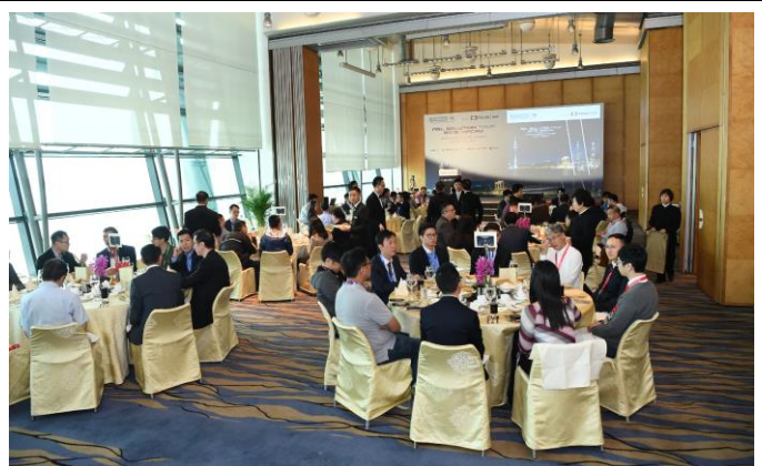
Exchange of views and knowledge among senior