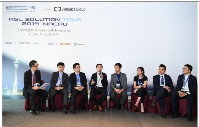
A technical panel full of ideas exchange and foresights.